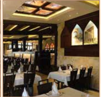
Amman - Jordan