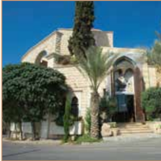
Jerash - Jordan